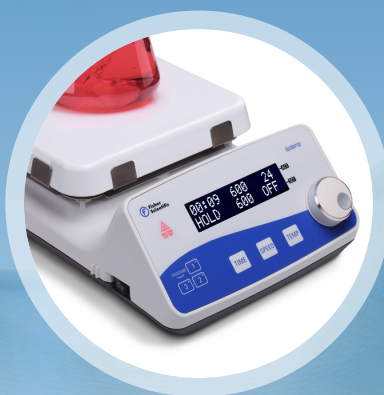
Isotemp Advanced Stirring Hotplate