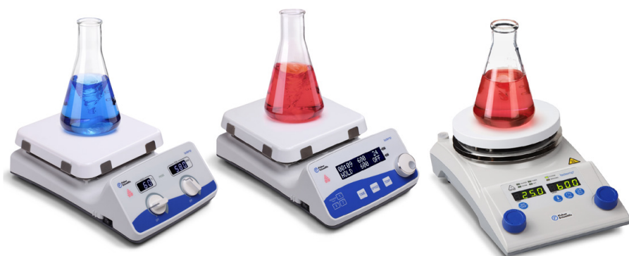
(L-R) Isotemp, Isotemp Advanced, Isotemp RT Advanced Series

With a wide variety of features and options, the Isotemp Series, Isotemp Advanced Series, and Isotemp RT Series of hotplates, stirrers, and stirring hotplates support all your applications – from basic stirring needs to the most precise high-temperature heating and control. Improve your process. Customize your workflow.