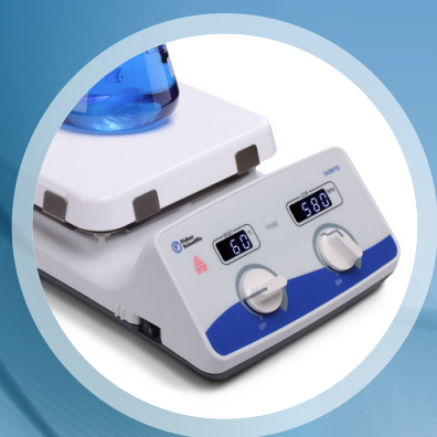
» Isotemp Stirring hotplate