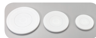
Non-slip Silicone Plate Covers