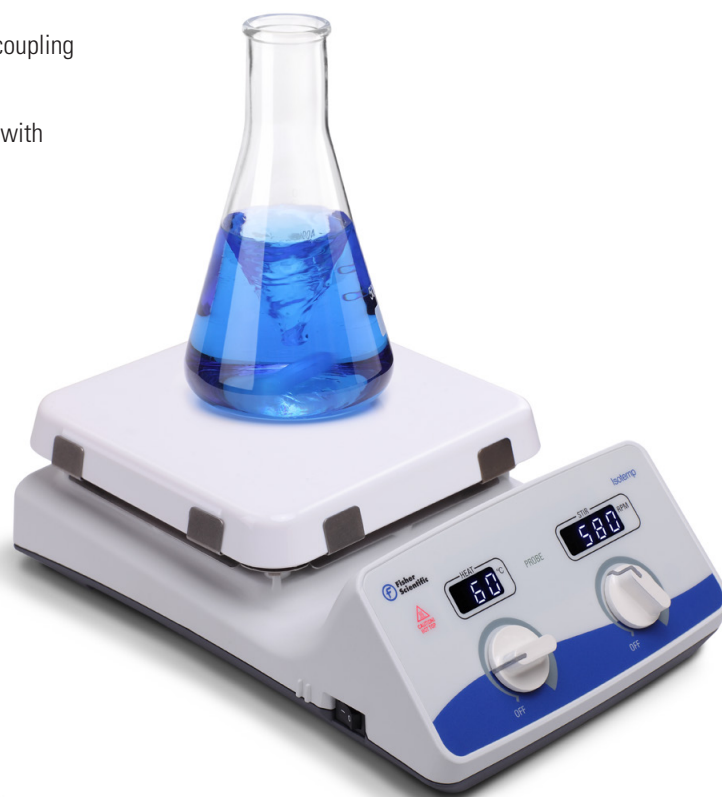
Isotemp Stirring Hotplate